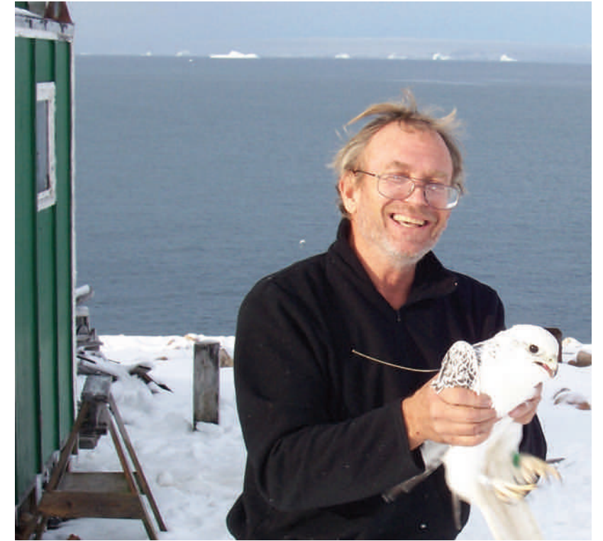
Greenland 2005.