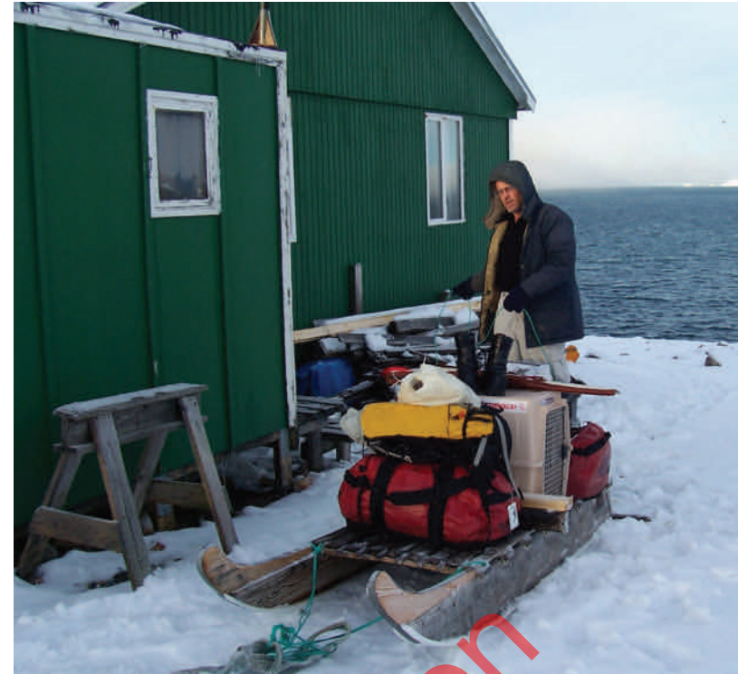
Greenland 2004.