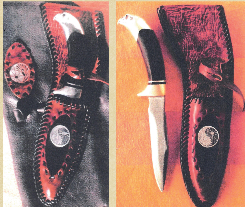
Knife presented to Sheikh Sultan bin Zayeed-Sterling silver and Gaboon ebony handle and O1 high-carbon tool steel blade. Sheath made of water buffalo calf and ebony.