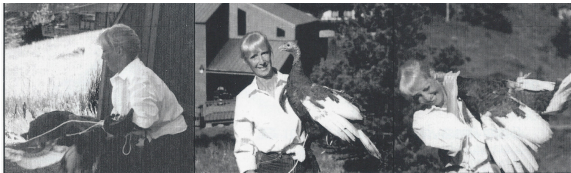
One more time, lift her up . . .