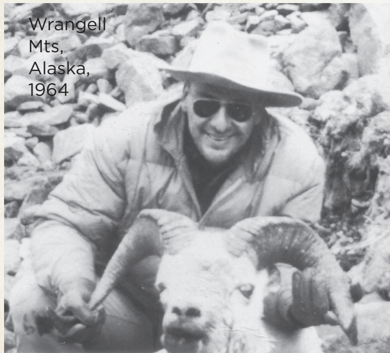
Wrangell Mts, Alaska, 1964