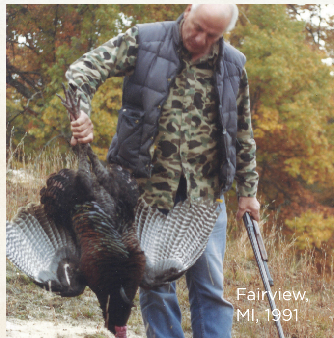
Fairview, MI, 1991