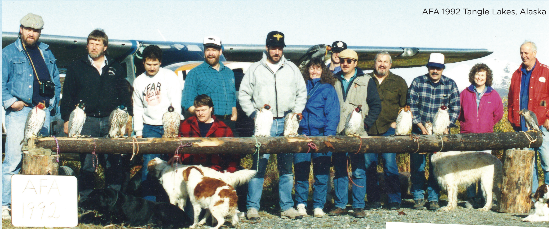
AFA 1992 Tangle Lakes, Alaska