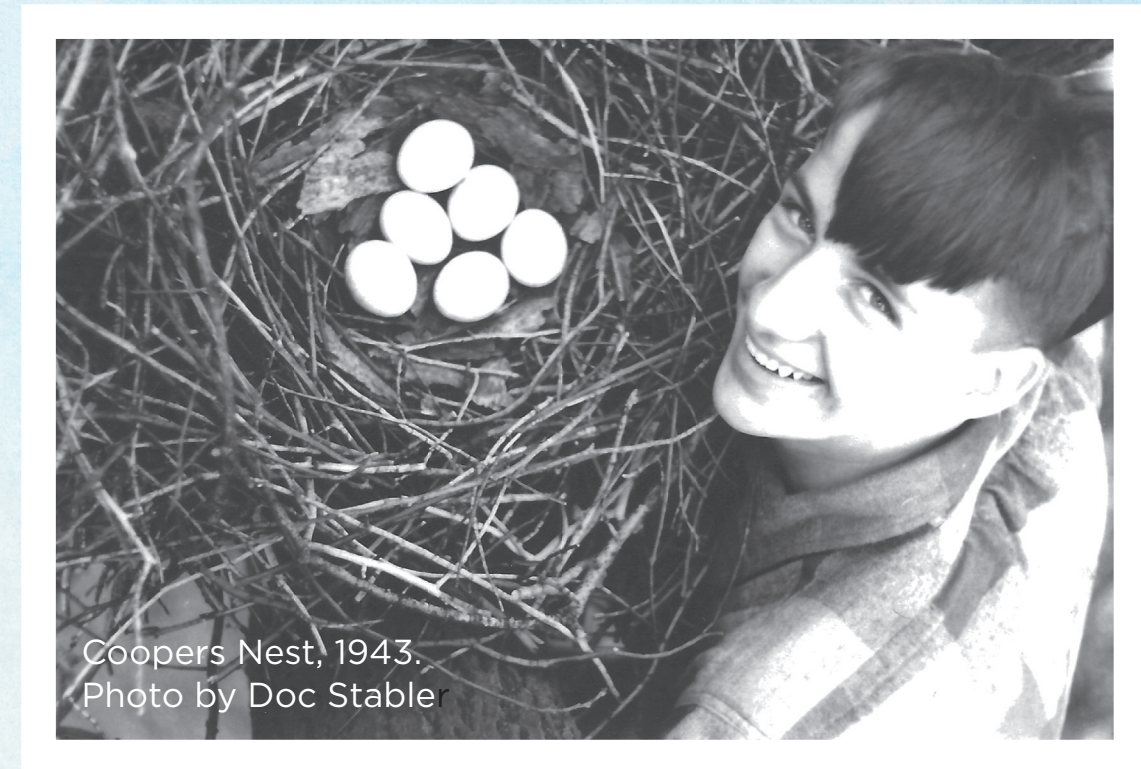
Coopers Nest, 1943.