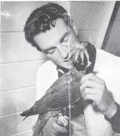
Tightening the falcon's hood. Hood, covering the eyes, keeps bird calm and quiet during trips.

All leather glove and gauntlet give Jerry protection from falcon's sharp claws. Bell attached to bird's leg can be heard 1/2 mile. Note special handmade perch.