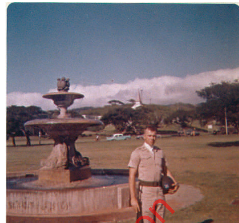
That's lil-ole me by our fountain in front of the barracks. It's in the mid-70s, typical "winter" scene in Hawaii!