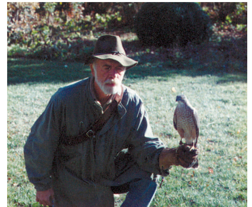
If you look close - my eyes are closed - it looks like I'm saying, "Please, Lord, don't let her break any tail feathers this season!"