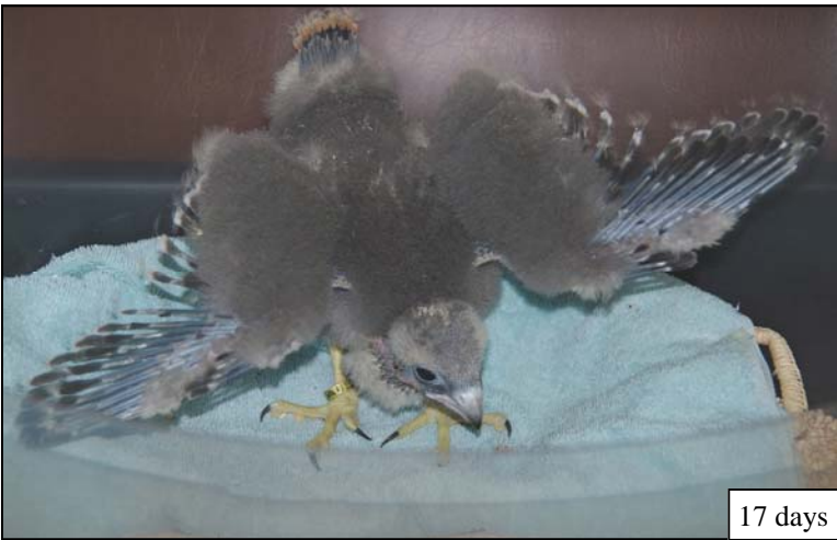
Chick stretching shows off its blood feathers

The newest education bird for the Interpretive Center was born the first week in June. The following photographs document the changes in size and feather structure. The light blue color that appears in the feathers of the 17 day image is blood that nourishes the feather growth. The 22 day image shows a chick tired from playing and ready for a nap. The 25 day image shows how chicks like to use their beak for tactile exploration. The day 29 image shows a chick with fledging on its mind.