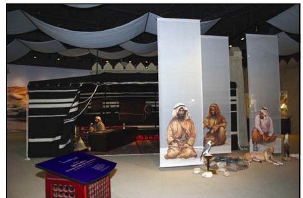
Goat-hair Hunting Tent Display

A gift was made in 2005 to construct a new 3,000 square-foot addition to house the goat-hair hunting tent and other displays to honor the late Sheikh Zayed bin Sultan Al Nahyan, a falconer and first President of the United Arab Emirates. This new wing had a special pre-opening in 2006, also sponsored by the UAE, with a special presentation to 157 international guests from thirty-four different countries who were flown in for the day from the NAFA Field Meet in Kearney, Nebraska. The official opening was held at the Archives' 20 th anniversary celebration in March 2007 at which time founding curator Kent Carnie passed the title and responsibilities of the office of curator to John Swift.