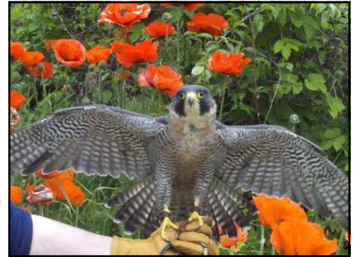
Trish Nixon, Raptor Specialist, with Gus, a male Peregrine Falcon in front the poppies at the Banks Train Station.

R iding a classic train through the Idaho mountains, along streams and rivers, through wooded areas is a wonderful experience. While gazing out the windows, you are likely to see wildlife, as well...elk, deer, geese, ducks, raptors. RAPTORS? What varieties of raptors? Funny you should ask. You can find out by riding the Thunder Mountain Line railroad out of Horseshoe Bend, Idaho during one of their special “Raptors & Rails” trips.