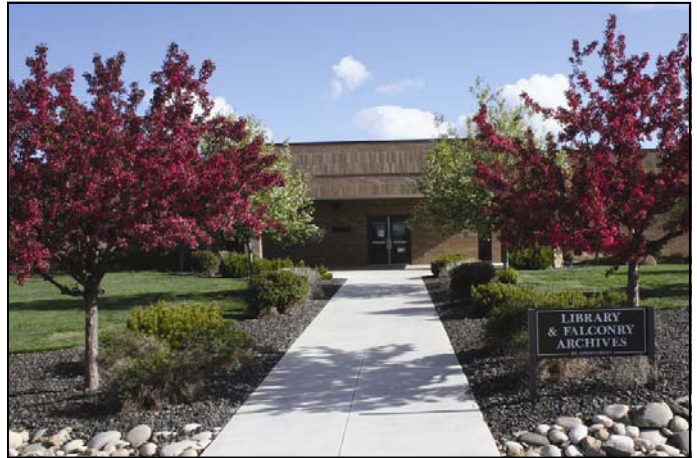
Entrance to the Herrick Collections Library and the Archives of Falconry

Throughout its twenty-five-year history, the Archives of Falconry has not relegated itself to serving as just a passive repository of donated materials. Rather, all along the personnel involved (curators, associates, and administrator) have been actively involved in promoting the facility through presentations to international, national, and state falconry associations; through publication of news and research articles in falconry magazines; through interpersonal contacts and communications; in recent years through twice-daily public tours as part of the regular experience of visitors to the World Center for Birds of Prey; and most recently through creation of a page on Facebook.