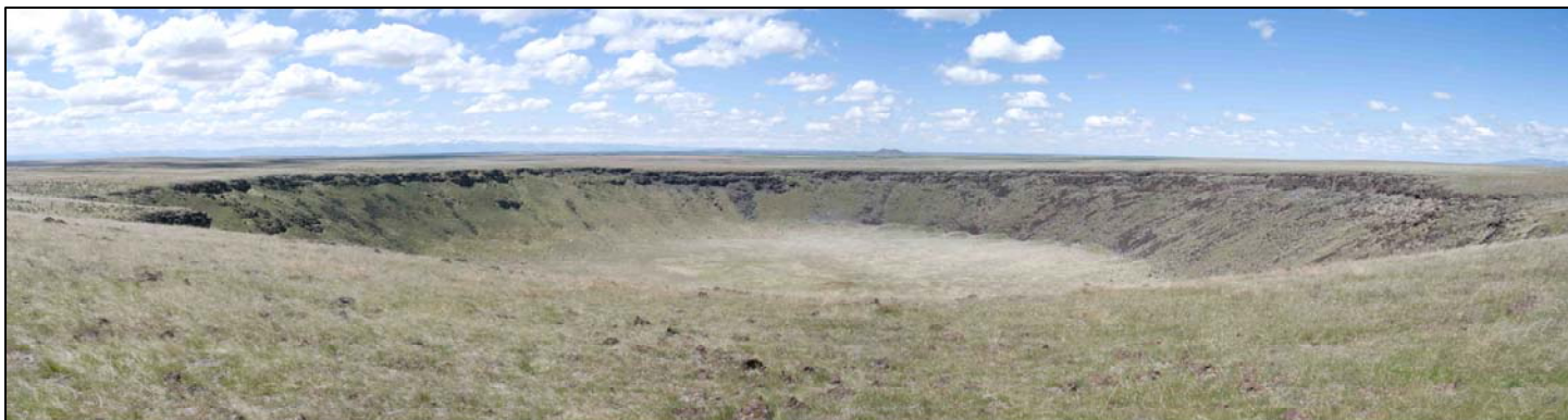
Volcanic cone northwest of Mountain Home, ID.

The preceding article was written by volunteer Bruce Parks. Bruce took all the images including the one below taken during the owl banding trip. Banding trips are a great way to view the Idaho landscape!