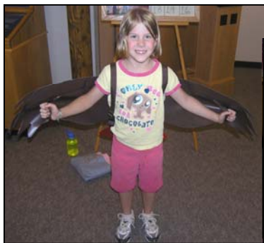
These girls are modeling our new Red-tailed Hawk wings.

The past twenty-five years have been significant in amassing substantial collections of books, art, equipment, and memorabilia and in establishing the reputation of the facility as a library/museum of international importance. The future holds many exciting possibilities, especially in the areas of digitization, networking, and global sharing of resources.