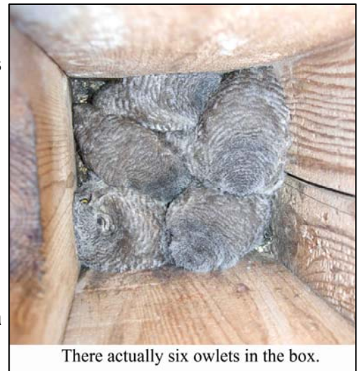
There actually six owlets in the box.

origin can be established. The bands are placed on the ankles of the owlets in a way that will not impact the owlet’s ability to fly and hunt. Although the females of the species are generally larger than the male, it was not possible to tell the difference between the owlets because they were essentially all the same size and their ankles are of similar size; unlike falcons, hawks, and other raptors whose ankles and body sizes make it easy to distinguish a male chick from a female in the same brood. In addition