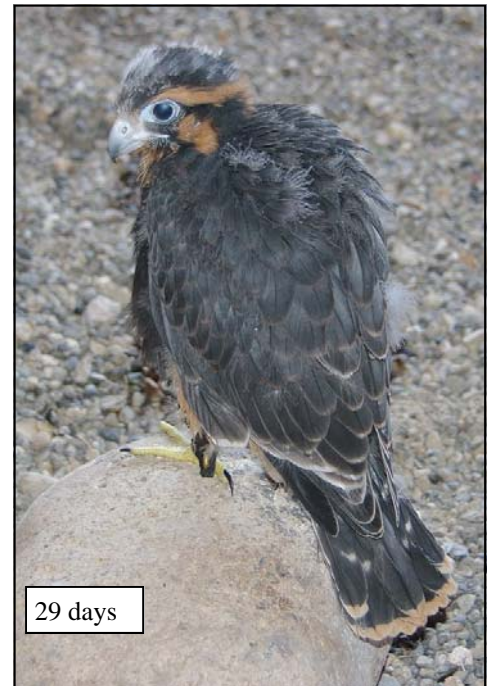
The chick is learning to perch and is “branching out.” By 32—35 days it will be fledging or taking its first flights.