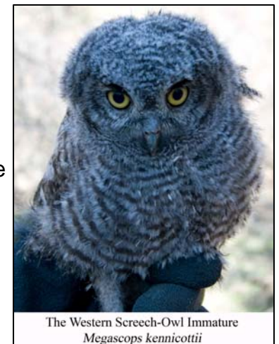
The Western Screech-Owl Immature Megascops kennicottii

A s a follow up to my trip last year to band Ferruginous Hawk chicks (Peregrine Summer 2010, page 5-6), this year I took advantage of a similar trip by the BLM to band Western-Screech Owlets in the Morley Nelson Snake River Birds of Prey National Conservation Area. Once again, I spent a great day successfully banding a group of owlets, traveling through the high plains of southern Idaho, observing a great number of birds, and learning about the fauna and flora of this distinctive area.