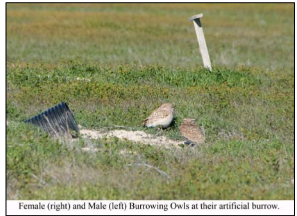
Female (right) and Male (left) Burrowing Owls at their artificial burrow.