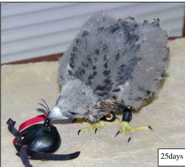
Connie Stanger, Curator of Birds, put the hood in the chick's box so it becomes used to it. Chicks explore by being tactile with their beaks. The hood will be used when transporting the bird.