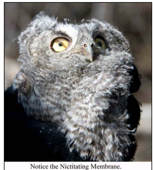
Notice the Nictitating Membrane.