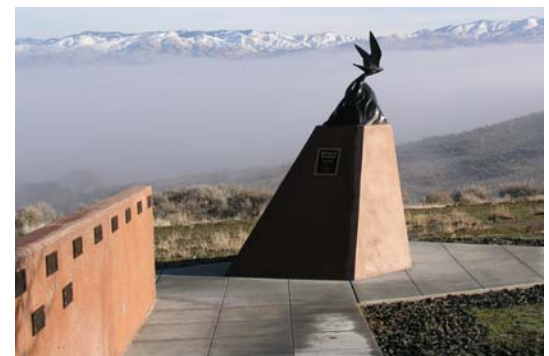
Wall of Remembrance

In 2006 a Wall of Remembrance was constructed to provide a monument for falconers to be recognized in perpetuity by their family and friends. An annual Spring Rendezvous was then inaugurated in March 2007 in order to provide a time when these families and friends could gather to celebrate and reflect on the lives and contributions of these falconers.