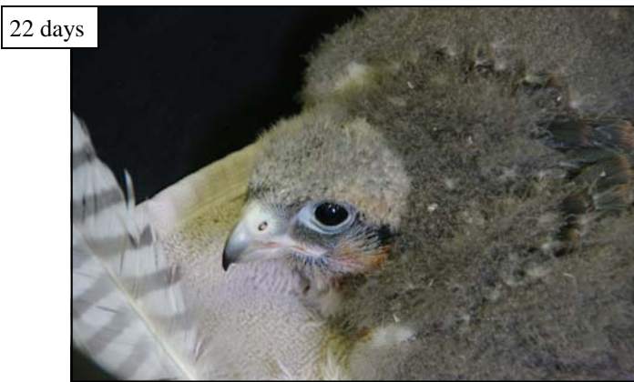
Time to nap after playing with a feather