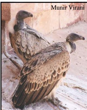
Long Billed Vultures

V ultures may not be the prettiest of birds but they perform a crucial clean-up and recycling role in our environment by consuming dead animals that might otherwise spread disease and contamination. The Peregrine Fund's World Center for Birds of Prey is celebrating this important bird at International Vulture Awareness Day on Saturday, Sept. 5.