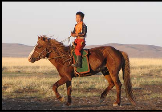
Mongolian boy on his horse.

I was sick with a nasty cold for 17 days five days after I left. The first couple of days I was really sick, but after that I just had horrible cough attacks and congestion.