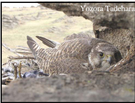
A Saker Falcon on her nest.

We moved to the "summer camp" yesterday. At 6:30am the neighbors decided to move and by 4pm we took down and put up 4 gers in a new grassy area. This is so that the grass grows back in the wintering area for the livestock next winter. It is really interesting to see how simple they live yet it is so hard for me.