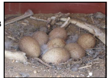
This nest was started by a Upland Buzzard using rib bones. A Saker took over the nest and laid some infertile eggs, then laid a new set of eggs. Yozora had to be a bit of a detective to figure it all out.