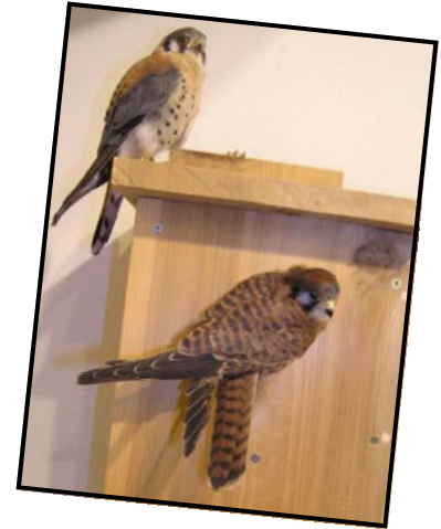
Male American Kestrel on top, female below

Consider putting up a kestrel box if you have kestrels in your neighbor-