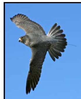
Gremlin banks to approach the lure.