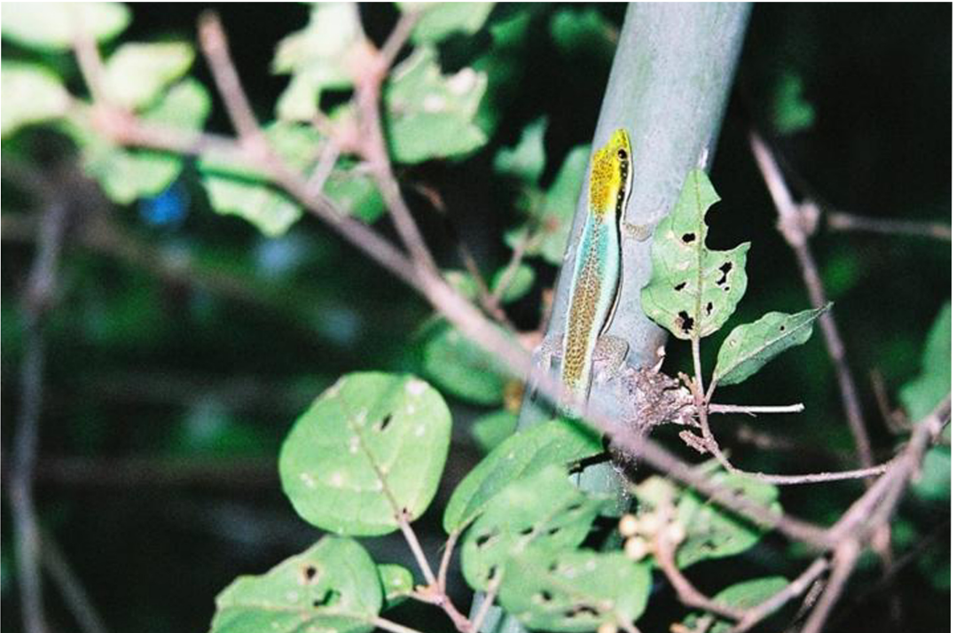
Figure 2. Phelsuma klemmeri found in the bamboo forest at Antsakoamalinka, western Madagascar.

These two day geckos were identified as Phelsuma klemmeri by their small size with a colorful yellow to orange head and neck, anterior back bluish and posterior brown with one light turquoise dorsolateral band, below one dark lateral band, and several white dorsal spots on hind legs. The tail was turquoise in both individuals (see Fig. 2). No tissue samples or specimens were collected. These two P. klemmeri were sympatric with P. kochi and P. mutabilis , but did not occupy the same microhabitat.